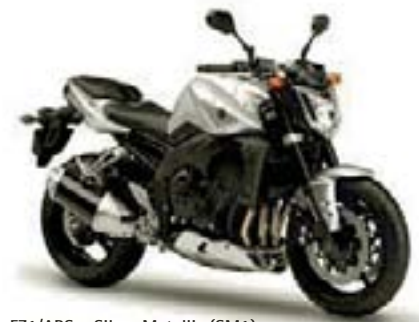
FZ1/ABS – Silver Metallic (SM1)