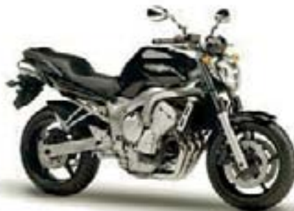
FZ6/ABS – Diamond Black (DNMB)