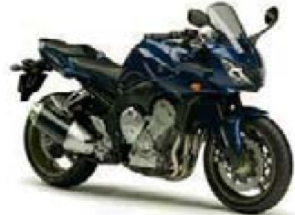
FZ1 Fazer/ABS – Ocean Depth (DPBMU)