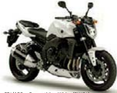
FZ1/ABS – Competition White (BWC1)

FZ1 ABS version depicted. The FZ1 is not fitted as standard with undercowling