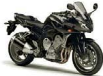
FZ1 Fazer/ABS – Graphite (DNMG)