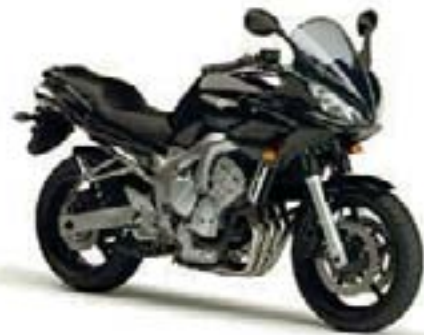
FZ6 Fazer/ABS – Diamond Black (DNMB)