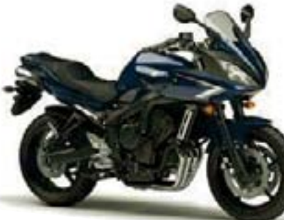
FZ6 Fazer S2/ABS – Ocean Depth (DPBMU)