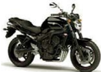
FZ6 S2 – Midnight Black (SMX)