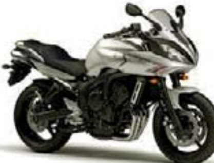
FZ6 Fazer S2/ABS – Silver Metallic (SM1)