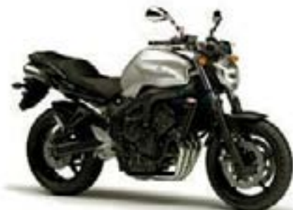
FZ6 S2 – Silver Metallic (SM1)