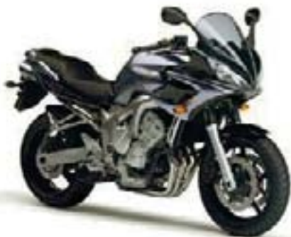
FZ6 Fazer/ABS –Silver Storm (BS4)