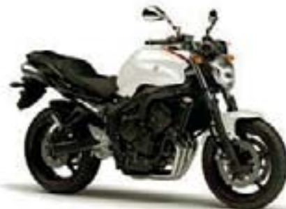
FZ6 S2 – Competition White (BWC1)