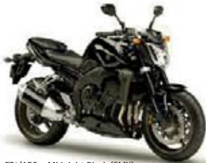
FZ1/ABS – Midnight Black (SMX)

FZ1 ABS version depicted. The FZ1 is not fitted as standard with undercowling