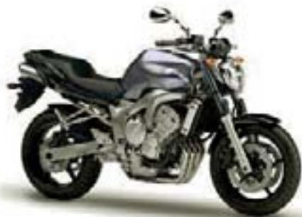
FZ6/ABS –Silver Storm (BS4)