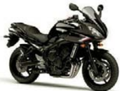
FZ6 Fazer S2/ABS – Midnight Black (SMX)