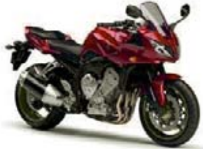
FZ1 Fazer/ABS – Lava Red (DRMK)