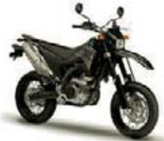
WR250X – Yamaha Black (YB)