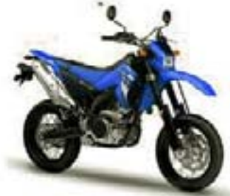
WR250X – Racing Blue (DPBSE)