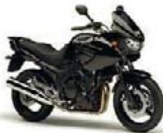
TDM900/A – Midnight Black (SMX)