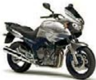
TDM900/A – Silver Tech (S3)