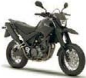
XT660X – Yamaha Black (YB)