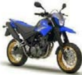
XT660X – Racing Blue (DPBSE)