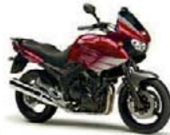
TDM900/A – Lava Red (DRMK)