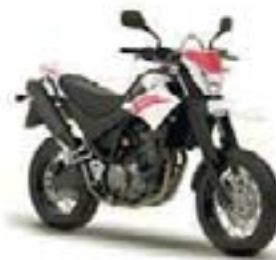
XT660X – Sports White (PWS1)