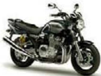
XJR1300 – Midnight Black (SMX)