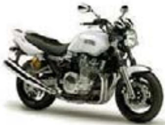
XJR1300 – Competition White (BWC1)