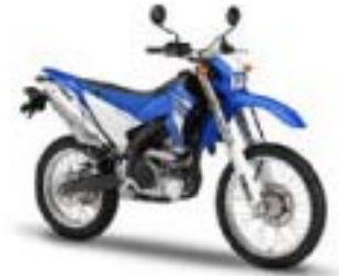
WR250R – Racing Blue (DPBSE)