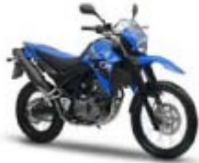
XT660R – Racing Blue (DPBSE)