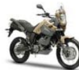
XT660Z Tenere – Desert Khaki (YNS5)