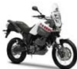
XT660Z Tenere – Competition White (BWC1)