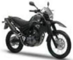
XT660R – Yamaha Black (YB)