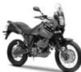
XT660Z Tenere – Midnight Black (SMX)