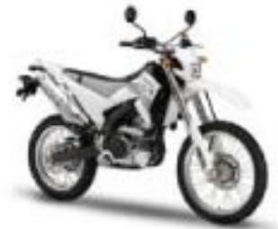
WR250R – Sports White (PWS1)